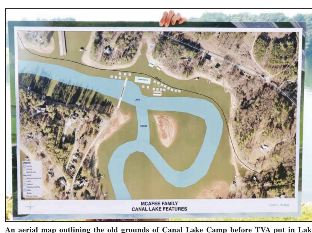
An aerial map outlining the old grounds of Canal Lake Camp before TVA put in Lake Nottely.

During the ribbon cutting, Paris distributed aerial maps with markings showing the